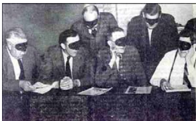
The Powers That Be

The Powers That Be will give you THREE pieces of evidence. At least one of these will be PICTORIAL and the remainder will be pieces of written evidence. These pieces may be from modern historians or people writing at the time of a particular historical event.